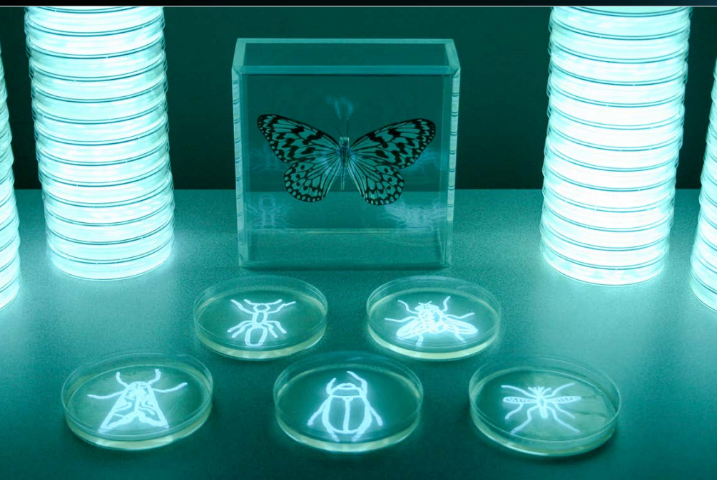
Bioluminescent bacteria become art. Pictured: A work titled "Insecta."

Cole cultures Photobacterium phosphoreum , then, using a paintbrush, draws the bacteria, which she refers to as her collaborators, into different shapes in a Petri dish. The biologist-artist then photographs the luminescent petri dishes to create what she calls modern works of provocative symbolism.