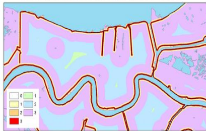
1 Mile Toxic Waste Site Buffer