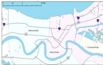
100 Yard Levee and 1 Mile Water Buffer